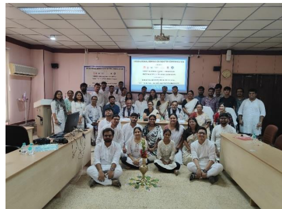
International Seminar on 'Disaster Communication' Centre for Journalism & Mass Communication (CJMC) Viksit Bharat Cell, Visva Bharati

I congratulate the organizers for arranging this significant seminar. I am sure the discussions that will take place during this seminar will enrich the bond between the people of two nations through each other's talents and technology. Thank you