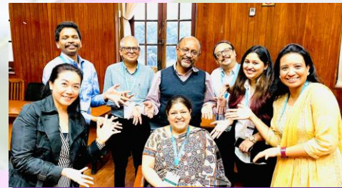
Coordination Team for STI Forum