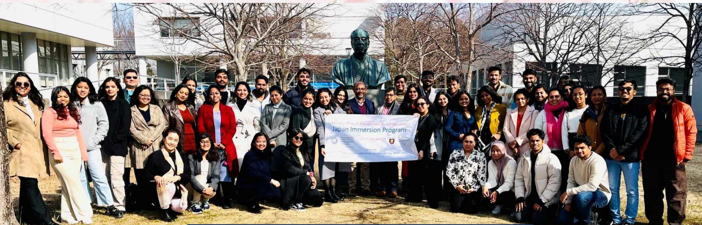
IIMK student meet GRIL students at Keio University SFC